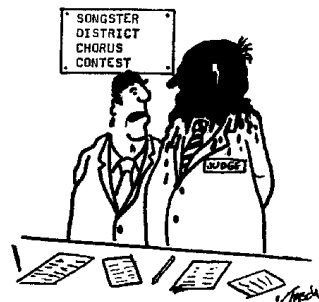
"SOMEHOW I FEEL THEY DIDN'T LIKE THE SCORE I GAVE THEM IN STAGE PRESENCE."