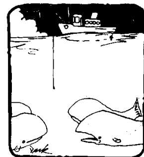
Uh-oh, here comes the mike again. Cut the barbershop quartet and go back to mournful whistling.