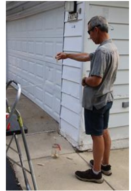
Clothespin drop is harder than it looks.