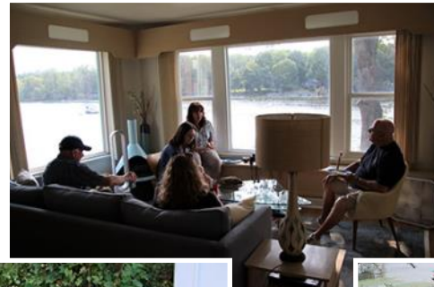
Eating in the A/C with a spectacular view of the Fox River.