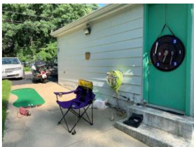
Games included: Golf Putting, Clothespin drop, Hatchet Throwing (plastic and Velcro); Bocce Ball, and of course, Bags.